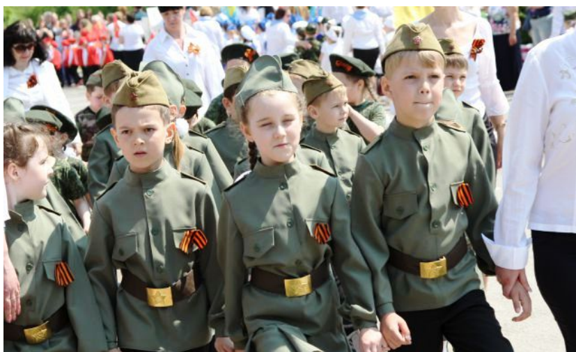
Photo 11. Pupils of primary school take part in the Victory Parade Lipetsk, 9 May 2018

Another key Soviet commemorative practice that exists in Russian schools from the Soviet times is the participation of schoolchildren in the Victory Parades, which are held on May 9 in every major Russian city. If there are military personnel in the city, then the servicemen of local garrisons and troops must take part in the parade. For example, in Lipetsk, the military pilots take a key part in the parade, while in Tambov the parade participants are traditionally the soldiers of the local garrison and servicemen of internal troops and police. Usually the parade is held on the morning of May 9 in the central square of the cities near the Victory Memorials. The officials read speeches, after which the columns of soldiers, police officers and other security services march on the square. The schoolchildren dressed in the uniform of the Great Patriotic War finish the festive parade (photo 11).