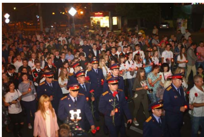
Photo 15. Lipetsk citizens and schoolchildren take part in the "Candle of Memory" 21 June 2018

It is interesting that the space of the war commemorations is not limited only to May 9 in school life. The action "Candle of Memory" has become equally important in recent years. It is held late in the evening on June 21 and has already become official in Lipetsk. The pupils of the senior classes of all schools and universities are obliged to come to Sobornaya Square by 22.00 and follow the Parade to the Victory Memorial in Heroes Square with lighted candles (21 июня в Липецке, 2018). The participation in the action is obligatory for all schools in the city of Lipetsk, it is formalized by the relevant orders of educational authorities (Участие в акции «Свеча памяти», 2018). The action gathered more than 2,5 thousand people. In addition to schoolchildren, citizens, students, 200 employees of law enforcement agencies, representatives of patriotic public associations and government bodies took part in it and carried candles (photo 15).