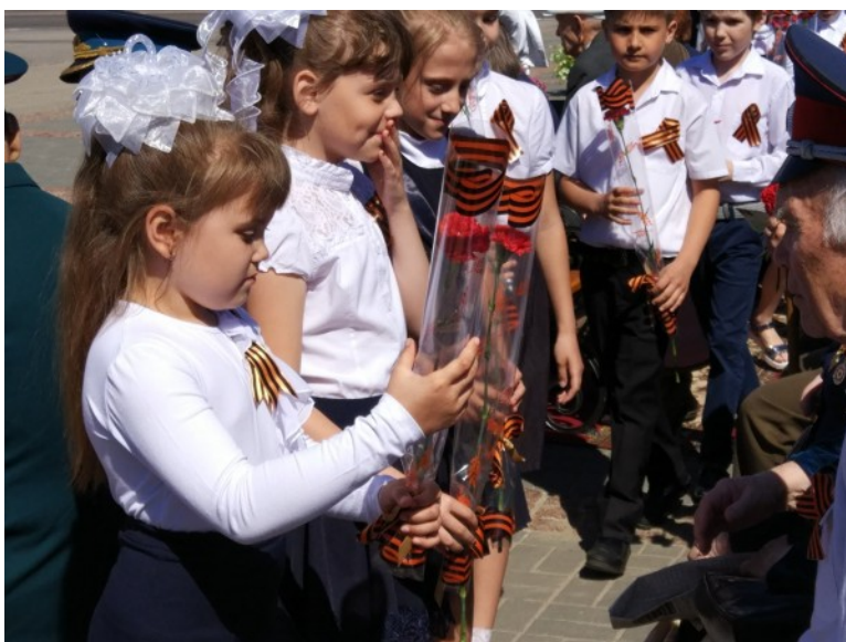
Photo 14. Students with St/George's ribbons give flowers to the veterans 9 May 2018 (Tambov)

It is interesting that the space of the war commemorations is not limited only to May 9 in school life. The action "Candle of Memory" has become equally important in recent years. It is held late in the evening on June 21 and has already become official in Lipetsk. The pupils of the senior classes of all schools and universities are obliged to come to Sobornaya Square by 22.00 and follow the Parade to the Victory Memorial in Heroes Square with lighted candles (21 июня в Липецке, 2018). The participation in the action is obligatory for all schools in the city of Lipetsk, it is formalized by the relevant orders of educational authorities (Участие в акции «Свеча памяти», 2018). The action gathered more than 2,5 thousand people. In addition to schoolchildren, citizens, students, 200 employees of law enforcement agencies, representatives of patriotic public associations and government bodies took part in it and carried candles (photo 15).