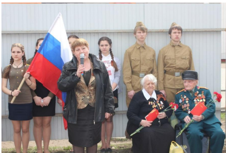
Photo 8. The annual sports contest of schoolchildren "Marathon of Victory" in Tambov in the presence of the war veterans

The veterans of the local conflicts (in Afghanistan, Chechnya) talk about their victories, promoting courage and readiness for heroism. It is interesting that the narrative of this discourse is in many respects similar to the narrative of the veterans of the Great Patriotic War. It shows that the very structure of the stories about the Victory in the war of 1941-1945 serves as a delineating, semantic framework for any other stories about the wars of Russia and the courage of its soldiers. The veterans have no other language of description than the one formed by the Soviet discourse on Victory. Thus, even if there are no survivors of the living memory of the war, the broadcast of the discourse, characteristic of "meetings with the veterans" as an indispensable attribute of the celebration of Victory Day, will be preserved. If possible, the participation of the veterans is even intensified. It is not limited to meetings, concert visits, but includes their presence at other events that have appeared only in modern Russia. For example, in the Tambov region the annual sports contest "Marathon of Victory" has been held for several years already, where the veterans act as a jury (Photo 8).