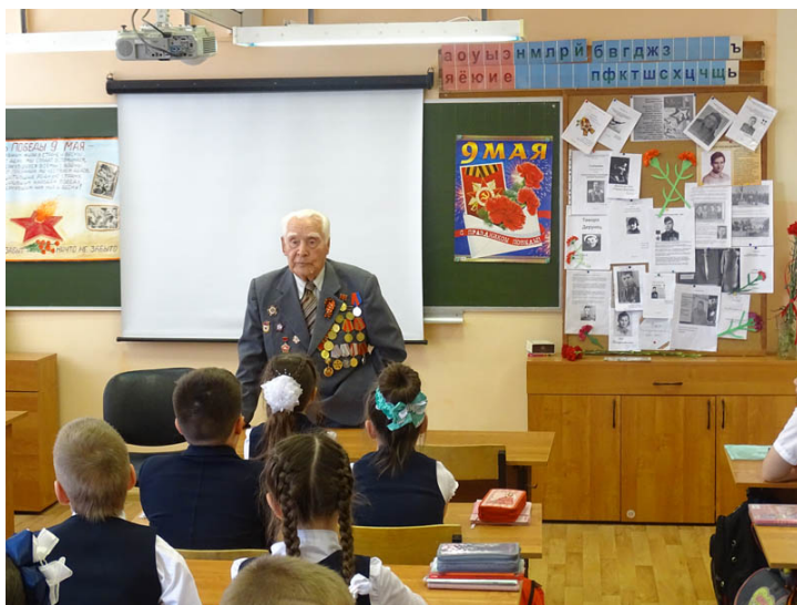
Photo 6. «The lesson of courage» at primary school, Tambov, 7 May 2018

Russia continue to remain, as in the Soviet school, a central element of commemorative practices (Photo 6).