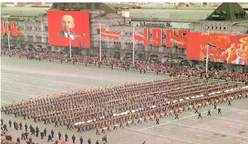
Photo 2. The Parade on Red Square, 9 May 1985

The Parade on Red Square, which included the passage of columns of military and armored vehicles of those military units that had taken part in the war played symbolic significant role. Some changes appeared only in the era of Gorbachev on the Victory Day parade on May 9, 1985. Not only representatives of military schools and combat arms, but also the veterans of the war (Photo 2).