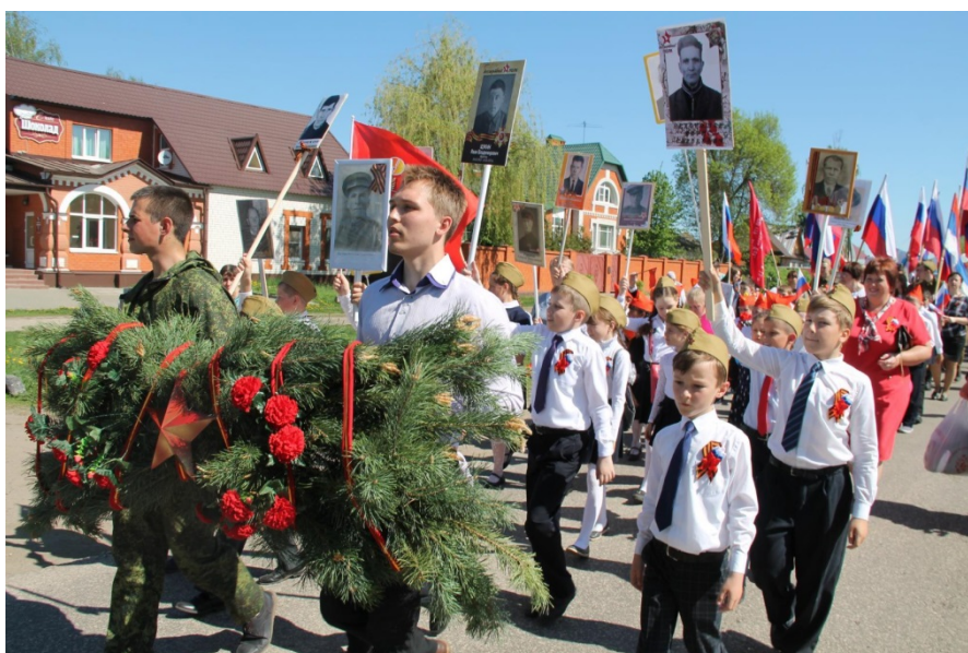
Photo 10. Schoolchildren with the portraits of their relatives in the "Immortal Regiment", 9 May 2018 (v. Dmitrievschina, Tambov region)

Despite the fact that the "Immortal Regiment" is not officially connected with school education, the resource of educational institutions is usually involved in the event. If in large cities (Tambov, Lipetsk) the participation of schoolchildren in it is encouraged (free production of a banner with a photo of a veteran, the organization of thematic columns), it is not obligatory, but at rural schools the participation of all pupils and their families is strictly obligatory. The refusal leads not only to reprimanding the student, but also to public censure, the consequence of which is further problems in learning and communication. Children and their parents are the central participants of the rural processions of the "Immortal Regiment" (Photo 10).