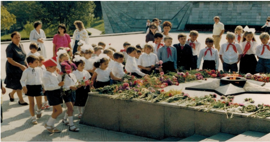
Photo 1. Soviet and English schoolchildren laid floral tribute at the memorial "Eternal fire" in Sochi, 9 May 1990

celebrating Victory Day derived from the celebration of the revolution with the preservation of their symbolic value. An exception was the festive firework, which would later become an obligatory element of the main holidays in the post-Soviet period. After 1965, a ritual of "minute of silence" appeared in all cities of the Soviet Union, as well as a ritual of laying floral tribute at the Tomb of the Unknown Soldier. The Tomb of the Unknown Soldier was a memorial complex in the center of a Soviet city, with the names of its residents who died in the war and the flame of "Eternal fire" (Photo 1).