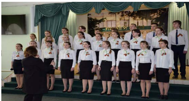
Photo 16. The choir of senior pupils of the lyceum No. 44 in Lipetsk at a festive concert on May 7, 2018.