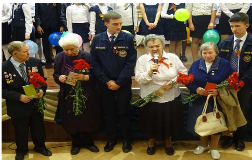
Photo 7. The veterans of the Ministry of Emergency Situations together with the veterans of the Great Patriotic War on the Victory Day celebration in one of Tambov schools, 2017

However, the practice of working with them has changed not only because of the age of the veterans, but also because of the transformation of some commemorative strategies. First, the place of the passing veterans of the Great Patriotic War is occupied by the participants of other military operations, who perform the same functions. They talk about the need to defend the Motherland and provide examples of heroism. Moreover, in the modern Russian school, the veterans of other wars, servicemen and even veterans of the Ministry of Emergency Situations come to meet with the veterans of the Great Patriotic War on May 9 (Photo 7).