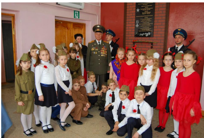
Photo 12. The participants of the event on April 17, 2018. School 4, Lipetsk

After the main official events, there are open field kitchens in the city's parks where everyone can try the food of the war years and where the music of the war time plays. In general, the participation of primary school pupils, dressed in the uniform of the war of 1941-1945 is an important element in the conduct of patriotic actions that are not related to the celebration of the victory over Germany. So, on April 17, 2018 in the 4th school of the city of Lipetsk within the framework of the project "The Living Memory of Generations" memorial plaques were erected for the Lipetsk citizens who died in the Afghan war (Торжественное открытие, 2018). The children, dressed in the uniform of the Great Patriotic War, opened the event (photo 12).