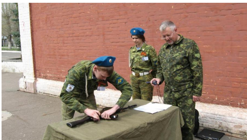
Photo 18. A school student dismantles the Kalashnikov assault rifle, 9 May 2018

However, modern schoolchildren in the Tambov region are more likely to answer questions about the history, which, as a rule, test the knowledge of the most striking facts of the Great Patriotic War of 1941-1945, then to demonstrate the ability to defend the Motherland. Moreover, as in the case of other commemorations there is no ideology behind the game "Zarnitsa" in the Russian version like the one in the USSR. This is a set of practices demonstrating military skills, the ability to obey orders and know the generally accepted set of facts about the history of the Great Patriotic War.