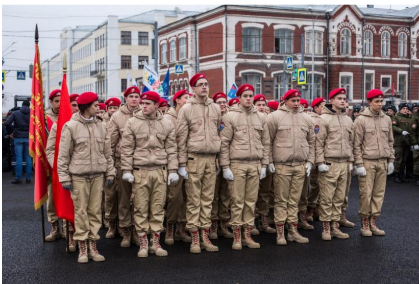
Photo 13. The "Unarmy" students as the participants at the rehearsal of the Victory parade in Tambov, April, 2018