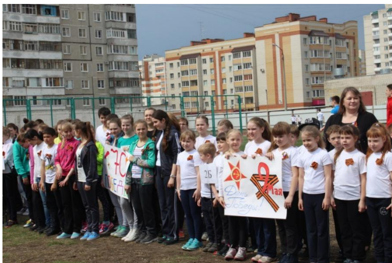
Photo 17. Primary school students at the annual sports contest "Marathon of Victory" (9 May 2018, Tambov)

However, the traditional events of the celebration of Victory Day at Russian schools don't include only a concert. The Russian school inherited the practice of organizing various sports competitions devoted to May 9. As in the case of concerts, these sporting events can be held at any other time of the year and are only a part of the general activity program of the school. It needs to organize intensive activities within the general sense framework Victory Day. So, for example, in the Tambov region the annual sports contest "Marathon of Victory" has been held for several years. This event is a sporting event in a short distance race for primary school students (photo 17). Accordingly, a fairly simple sports event receives a special status, since it is held on May 9 or on the eve of the holiday.