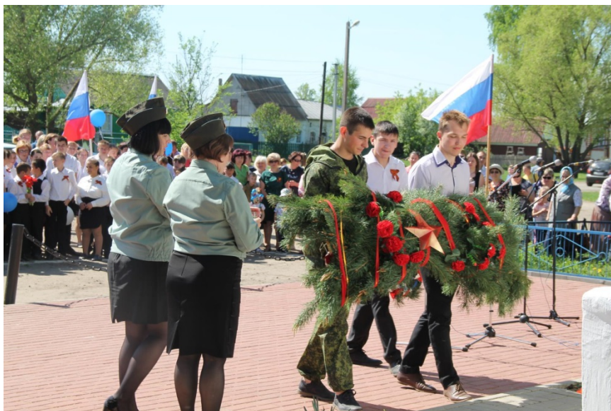
Photo 5. Laying the floral tribute at the memorial of the victims, v. Dmitrievschina, Tambov region, 9 May 2018