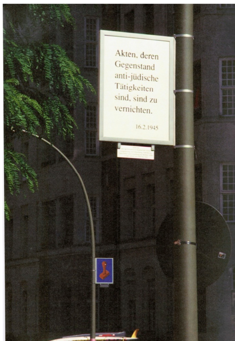
The inscription back reads (translated): „Files covering anti-Jewish activities are to be destroyed. 16.02.1945

Linking these perspectives allows to extend the concept of agency, focusing on the independent examination of historical and political narratives (cf. KMK, 2014) and the ability to take part in their constant and contested rewriting.