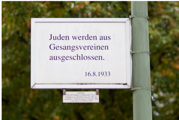
The inscription back reads (translated): „Jews are banned from choral societies. 16.8.1933“.