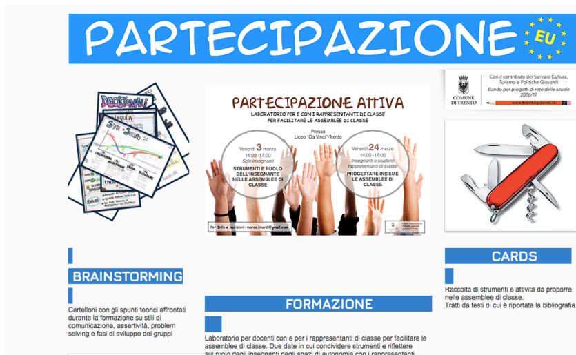
Figure 1: The website of 'Partecipazione plurale'