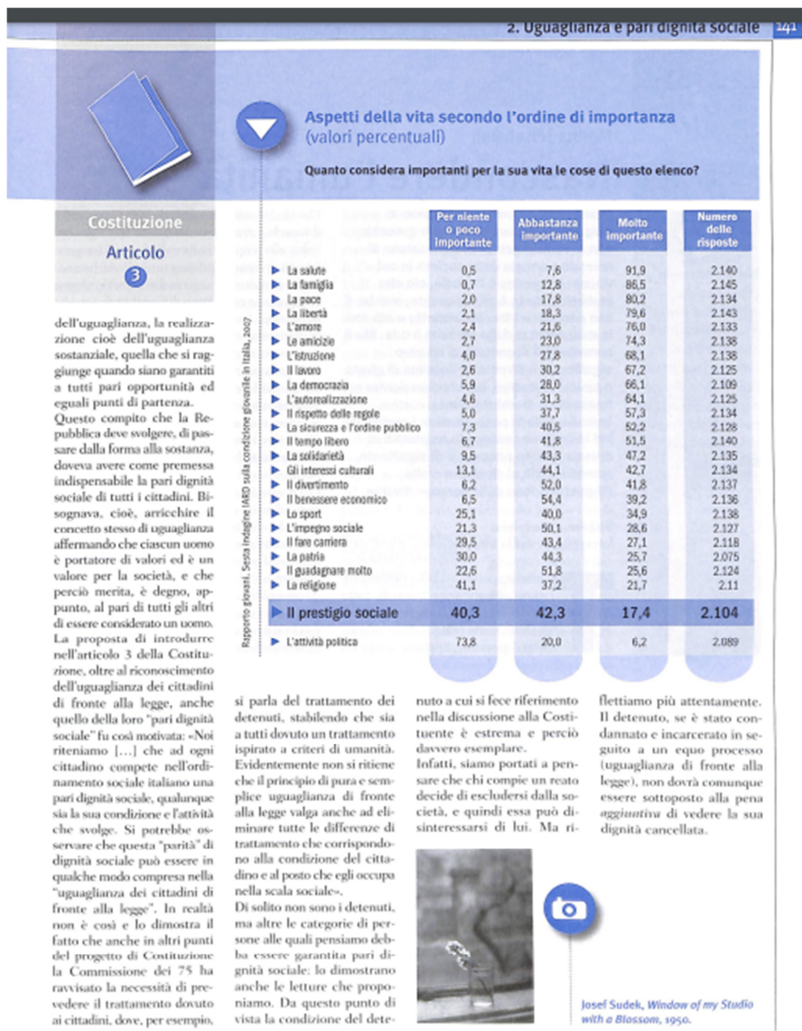
Figure 7: from the school book Binazzi, Tucci, Bertini (2011).

efforts referred to how watching video or using internet in appropriate way.