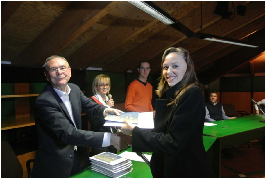
Figure 9: The President of the Provincia Autonoma di Trento, Bruno Dorigatti, delivering the book of the Italian Constitution to the new voters (18 years old)

There are plenty of Associations, volunteering groups at local, national and international level dealing with tasks related to citizenship education, very randomly listed: Clean up, Libera. Associazioni, nomi e numeri contro le mafie, MFE (Movimento Federalista Europeo), Italian sections of international associations (like Amnesty International), even Municipalities, Regional and Provincial Councils, religious groups, in all Italian regions, although with differences among the geographical parts of the country. In Italy there is less tradition for volunteering in comparison to the Northern European countries, anyway there are 44000 volunteering associations according to the Report of Csvnnet (Coordinamento Nazionale dei Centri di Servizio per il Volontariato) 2015, and they contribute indirectly to develop civic responsibility.