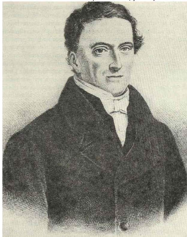
3: Johann Friedrich Herbart (Butts 1954, p. 404)