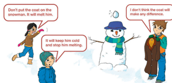
Figure 1 Snowman: (Source: http://www.conceptcartoons.com/science/subway-1.htm )

Several case studies are illustrating teacher perceptions of the outcome of CC in science classes. Although those teachers used CCs in different ways similarly results are reported (cf. Morris et al. 2007):