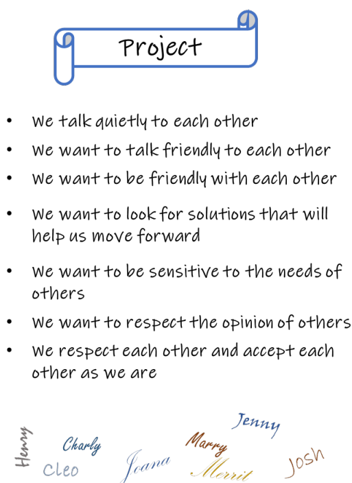
Figure 3: Signed behavioural contract.