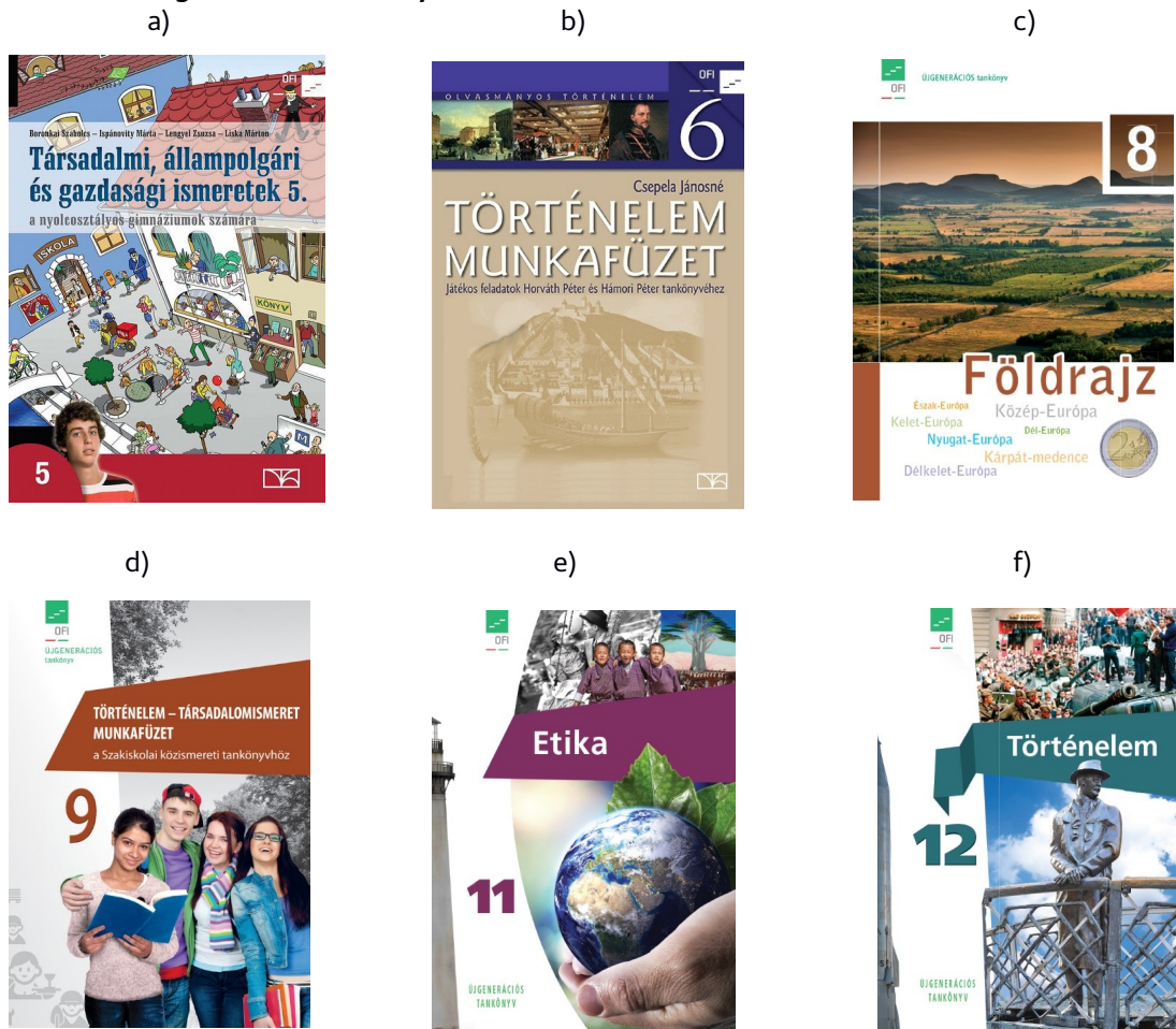
Figure 5: Social science related textbooks: a) Social, Citizenship and Economic Studies textbook for grade 5 students of the 8-year-long secondary school; b) History Workbook for grade 6, c) Geography textbook for grade 8; d) Social Studies workbook for grade 9 vocational students; e) Ethics textbook for grade 11 secondary students; f) History textbook for grade 12 secondary students

Outside the officially approved textbooks as it is mentioned in the previous section some civic organizations also support social science education through developing teaching materials and offering training for students and teachers as well. However, the number of teachers and students who actually participate and make use of these materials is limited.